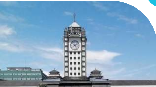
GMC, Kozhikode 21st-22nd Feb. 2026 (Sat-Sun)