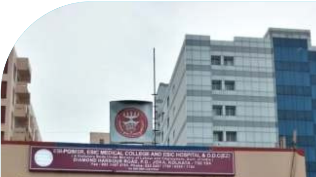
ESIMC, Kolkata, Joka 14 th -15 th Feb. 2026 (Sat-Sun)