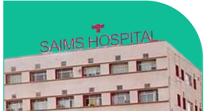
SAIMS Indore 17th-18th Feb. 2026 (Tue-Wed)